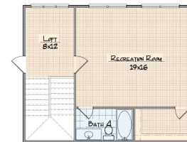
Upper Level Floor 504 sf

for illustrative purposes only. design and prices are subject to change. reproduction without permission is prohibited.