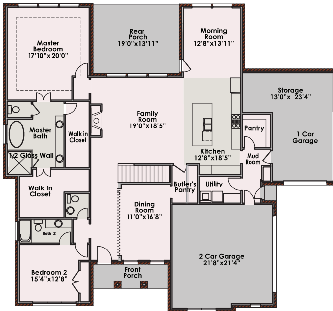
Main Level Floor 2,572 sf