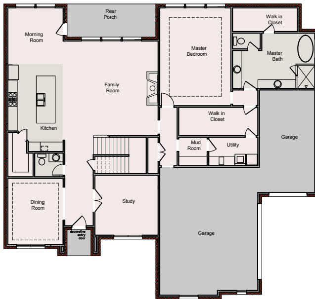
Main Level Floor 2447 sf