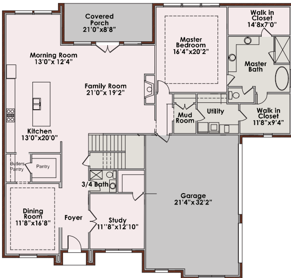
Main Level Floor 2,668 sf