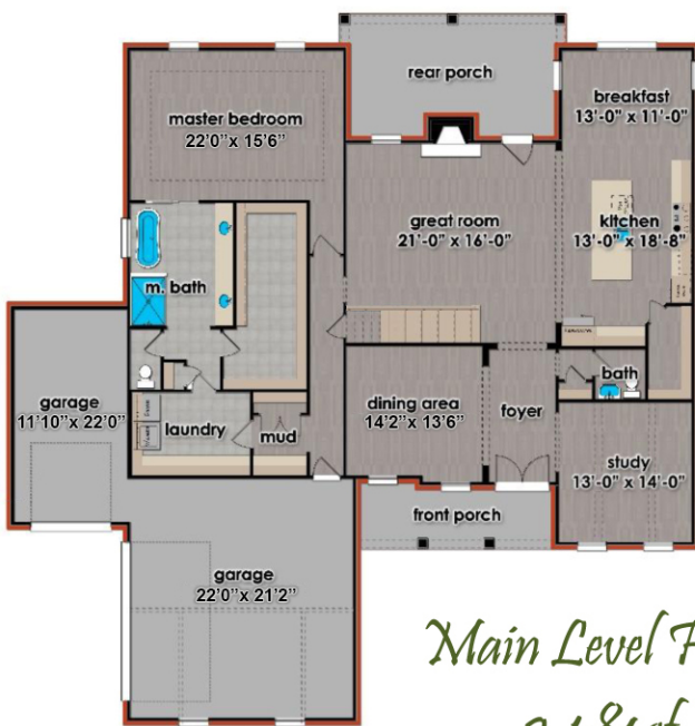
Main Level Floor 2,481 sf