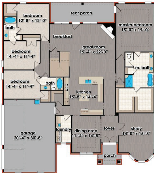
Main Level Floor 3,034 sf