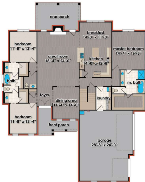
Main Level Floor 2,461 sf