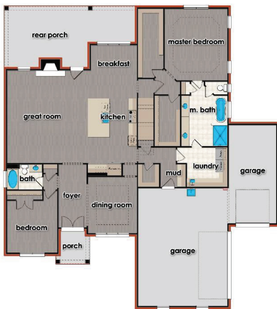
Main Level Floor 2,376 sf