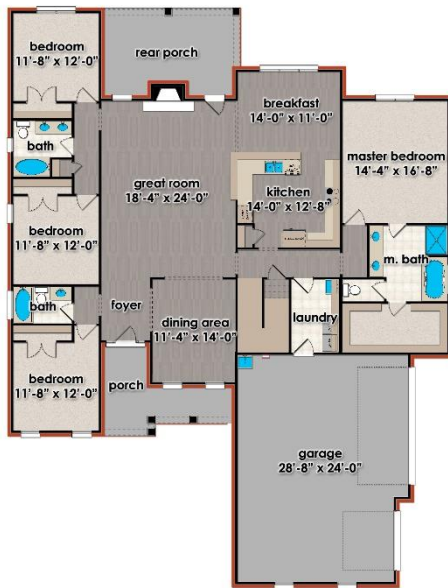
Main Level Floor 2,568 sf