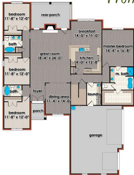
Main Level Floor