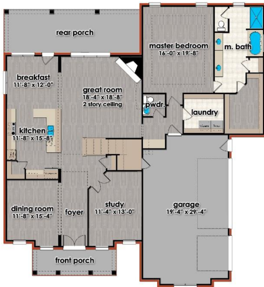
Main Level Floor